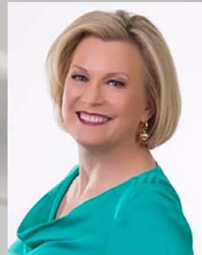
Susan Ford Bales